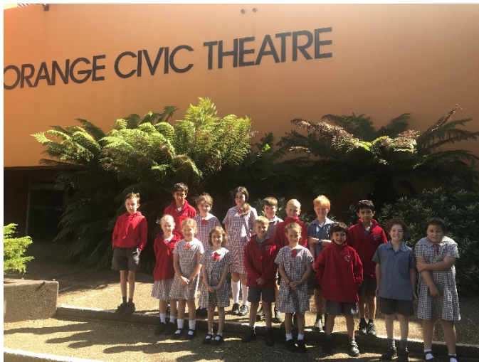
78 story Tree House

Today students in years 2 to 6 attended the Civic Theatre to see the play 78 Storey Tree House.