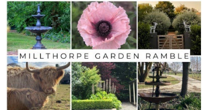
Ramble with us this November 4th & 5th, 2023

A reminder about the Garden Ramble coming up in a few weeks, we will be needing volunteers and donations of cold drinks, cakes and slices. Further information will be coming home shortly regarding availability and location for the garden.